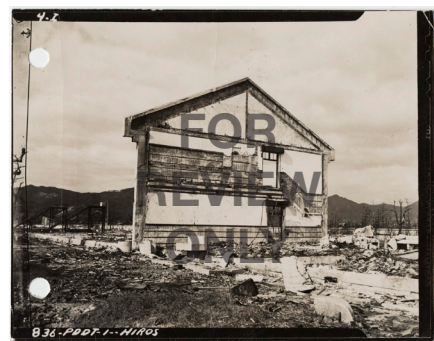
United States Strategic Bombing Survey, Physical Damage Division [Remains of a school building], November 17, 1945 Gelatin silver contact print International Center of Photography