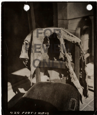
United States Strategic Bombing Survey, Physical Damage Division [Charred boy's jacket found near Hiroshima City Hall], November 5, 1945 Gelatin silver contact print International Center of Photography