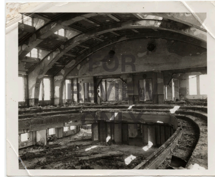
United States Strategic Bombing Survey, Physical Damage Division [Interior of Hiroshima City Hall auditorium with undamaged walls and framing but spalling of plaster and complete destruction of contents by fire], November 1, 1945 Gelatin silver print