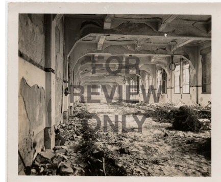
United States Strategic Bombing Survey, Physical Damage Division [Complete destruction of wooden floor and telephone switch and relay racks of Hiroshima Telephone Company, Central District Exchange], October 28, 1945 Gelatin silver print International Center of Photography