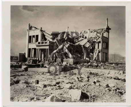
United States Strategic Bombing Survey, Physical Damage Division [Ruins of Chugoku Coal Distribution Company or Hiroshima Gas Company], November 8, 1945 Gelatin silver contact print International Center of Photography