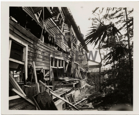
United States Strategic Bombing Survey, Physical Damage Division [Buckle of north wall of wing number one of Funairi Grammar School, Hiroshima], November 20, 1945 Gelatin silver print International Center of Photography