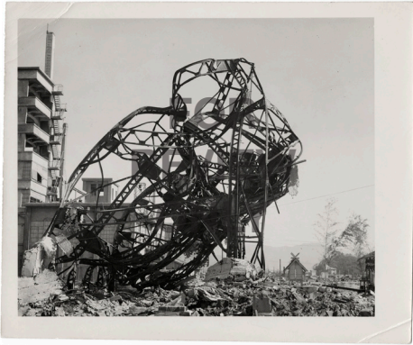
United States Strategic Bombing Survey, Physical Damage Division [Distorted steel-frame structure of Odamasa Store, Hiroshima], November 20, 1945 Gelatin silver print