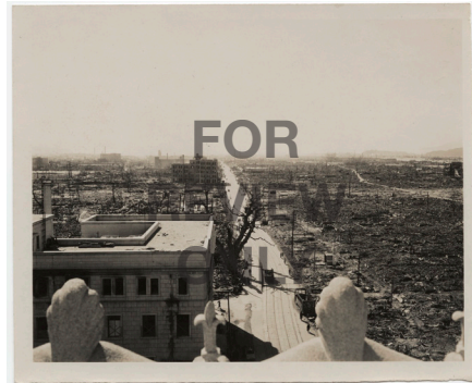
United States Strategic Bombing Survey, Physical Damage Division [Rooftop view of atomic destruction, looking southwest, Hiroshima], October 31, 1945 Gelatin silver print International Center of Photography