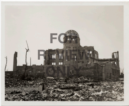
United States Strategic Bombing Survey, Physical Damage Division [Ruins of the Hiroshima Prefectural Commercial Exhibition Hall (A-Bomb Dome)], October 24, 1945 Gelatin silver print International Center of Photography