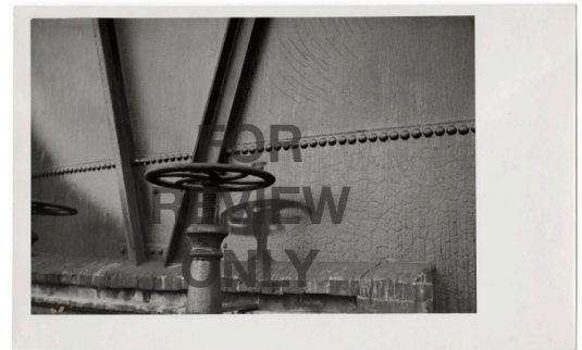
United States Strategic Bombing Survey, Physical Damage Division ["Shadow" of a hand valve wheel on the painted wall of a gas storage tank; radiant heat instantly burned paint where the heat rays were not obstructed, Hiroshima], October 14–November 26, 1945 Gelatin silver print