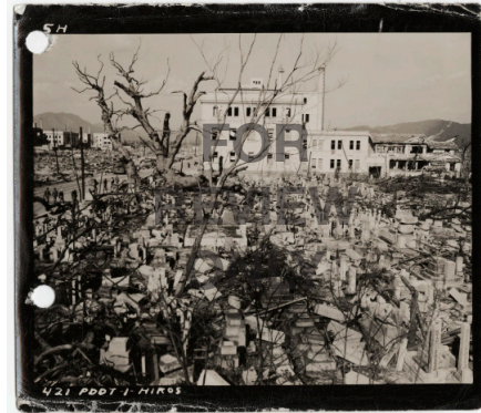
United States Strategic Bombing Survey, Physical Damage Division [Cemetery with debris, on the grounds of Kokutai Temple, showing sacred camphor tree charred by blast and Bank of Japan in background, Hiroshima], November 5, 1945 Gelatin silver contact print International Center of Photography