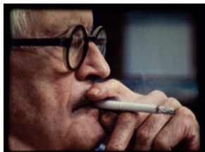
Tacita Dean, Portraits, 2016.