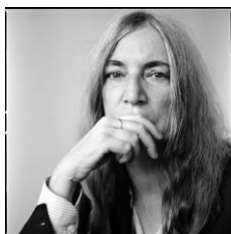
Brigitte Lacombe, Patti Smith, New York, NY, 2014.