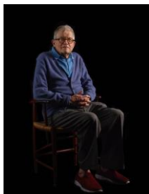
Catherine Opie, David, 2017.