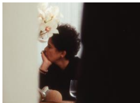
Tacita Dean, One Hundred and Fifty Years of Painting, 2021.