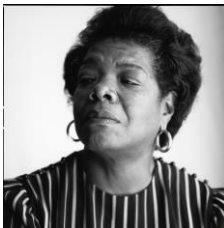
Brigitte Lacombe, Maya Angelou , New York, NY, 1987. © Brigitte Lacombe