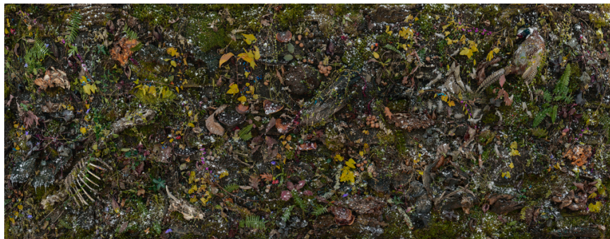
Tanya Marcuse, Woven N° 30 , 2018. 62 x 160 in. © Tanya Marcuse