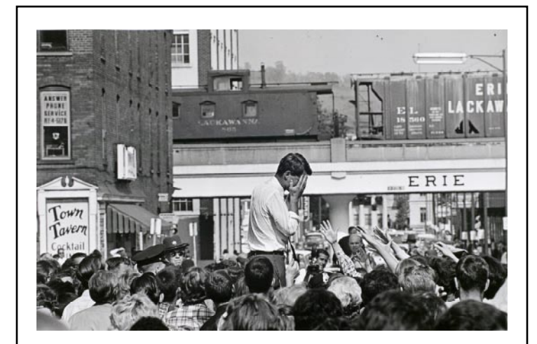
Cornell Capa [Robert F. Kennedy campaigning in Elmira, New York], September 1964

Through viewing these museum exhibitions, students will explore how photographers relate to and affect their subjects and what it means to be a "concerned photographer" who wants to educate and change the world with his or her pictures. The accompanying activities will help students to deepen their understanding of the ideas addressed in the exhibitions and provide them with hands-on activities that engage them with the photography. These lessons and activities are broken down as pre-visit and post-visit activities for junior high (6 - 8) and high schools (9 - 12). They are designed to be integrated with Social Studies, Global History, Humanities, Arts, and English Language Arts curricula.