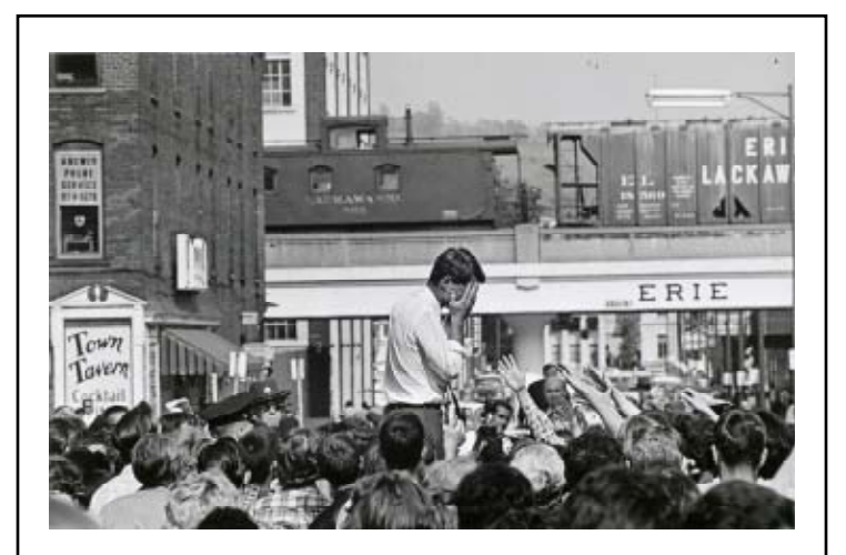
Cornell Capa [Robert F. Kennedy campaigning in Elmira, New York], September 1964 © Cornell Capa/Magnum

Through viewing these museum exhibitions, students will explore how photographers relate to and affect their subjects and what it means to be a "concerned photographer" who wants to educate and change the world with his or her pictures. The accompanying activities will help students to deepen their understanding of the ideas addressed in the exhibitions and provide them with hands-on activities that engage them with the photography. These lessons and activities are broken down as pre-visit and post-visit activities for junior high (6 - 8) and high schools (9 - 12). They are designed to be integrated with Social Studies, Global History, Humanities, Arts, and English Language Arts curricula.