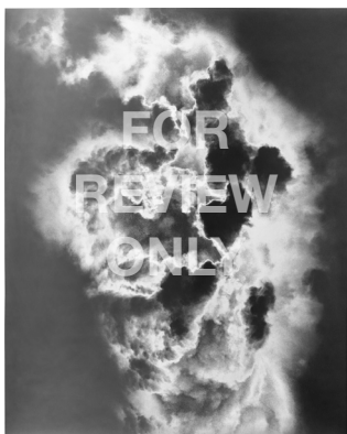
Lisa Oppenheim, Man holding large camera photographing a cataclysmic event, possibly a volcano erupting, 1908/2012 (version XI) , 2012. Courtesy the artist and Klosterfelde, Berlin.