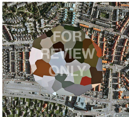
Mishka Henner, Unknown Site, Noordwijk aan Zee, South Holland , 2011.