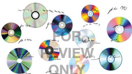
Oliver Laric, Versions , 2012. Courtesy the artist and Tanya Leighton, Berlin; and Seventeen, London.