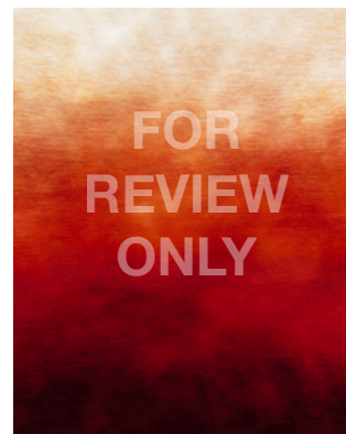
Trevor Paglen, The Fence (Lake Kickapoo, Texas) , 2010. Collection of the New School Art Collection; Courtesy the artist; Altman Siegel, San Francisco; Metro Pictures, New York; Galerie Thomas Zander, Cologne.