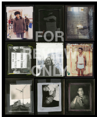
Jim Goldberg, Proof (detail), 2011.