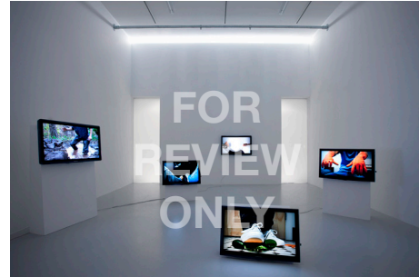
A.K. Burns, Installation, Touch Parade , 2011, TAG The Hague, Netherlands, 2012. Courtesy the artist and Calicoon Fine Arts, NY. Photo: Gert Jan van Rooij.