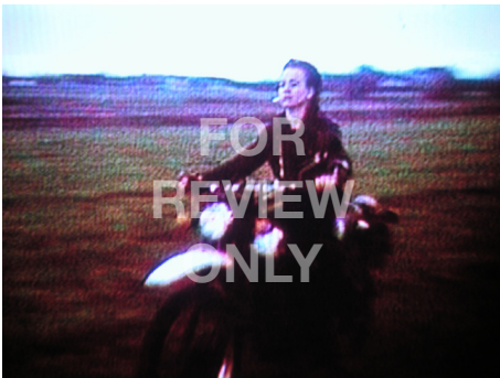
Hito Steyerl, November , 2004.