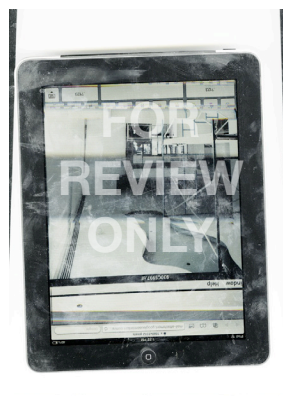
Andrea Longacre-White, Pad Scan (International Center of Photography) , 2013.