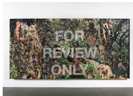
Elliott Hundley, Pentheus , 2010.