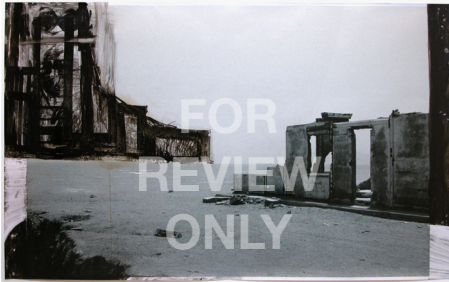
Huma Bhabha, Bagram , 2010.