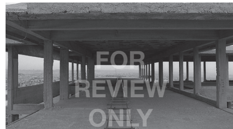
Nir Evron, A Free Moment , 2011. Courtesy the artist and Chelouche Gallery, Tel Aviv.