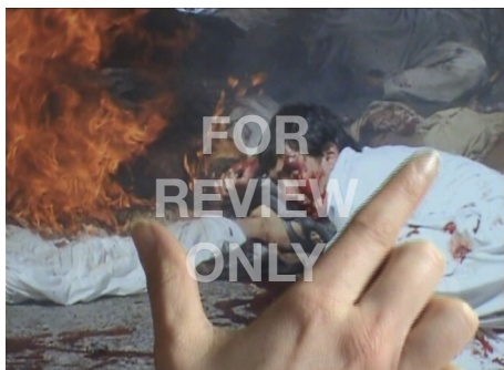
Thomas Hirschhorn, Touching Reality, 2012.