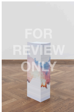
Aleksandra Domanović, Installation, Untitled (30.III.2010) , 2010, installation view, "From you to me" (detail), Kunsthalle Basel, 2012.