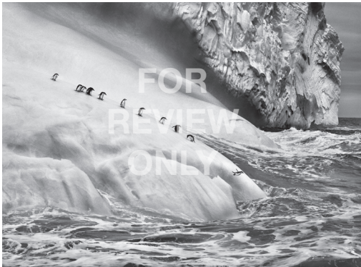
Sebastião Salgado, Chinstrap penguins ( Pygoscelis antarctica ) on icebergs located between Zavodovski and Visokoi islands. South Sandwich Islands. 2009. © Sebastião Salgado/Amazonas Images-Contact Press Images.