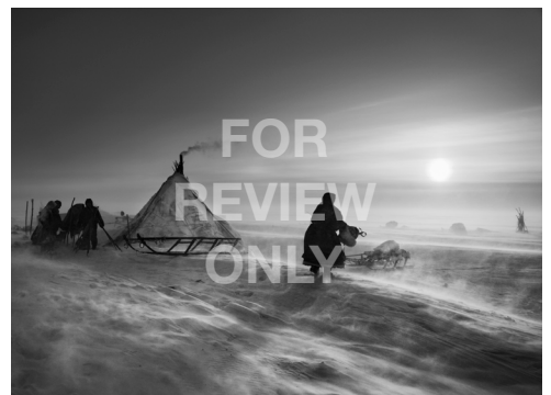
Sebastião Salgado, North of the Ob River, about 100 kilometers inside the Yamal peninsula, fierce winds keep even daytime temperatures low. Yamal peninsula, Siberia. Russia. 2011.