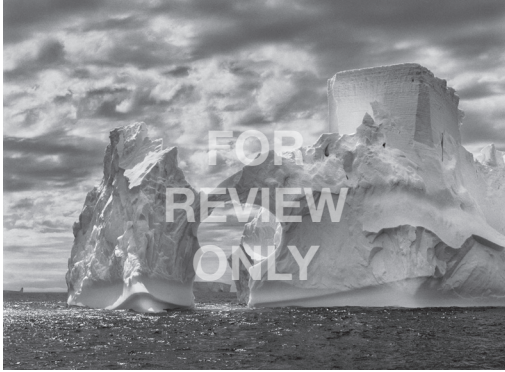
Sebastião Salgado, Iceberg between Paulet Island and the South Shetland Islands on the Antarctic Channel. At sea level, earlier flotation levels are clearly visible where the ice has been polished by the ocean's constant movement. High above, a shape resembling a castle tower has been carved by wind erosion and detached pieces of ice. The Antarctic Peninsula. 2005. © Sebastião Salgado/Amazonas Images-Contact Press Images.