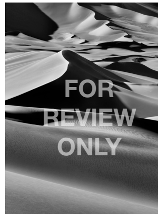
Sebastião Salgado, Large sand dunes between Albrg and Tin Merzouga, Tadrart. South of Djanet. Algeria. 2009. © Sebastião Salgado/Amazonas Images-Contact Press Images.