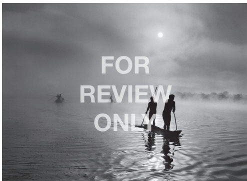
Sebastião Salgado, In the Upper Xingu region of Brazil's Mato Grosso state, a group of Waura Indians fish in the Puilanga Lake near their village. Brazil. 2005. © Sebastião Salgado/Amazonas Images-Contact Press Images.