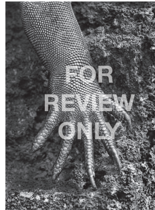
Sebastião Salgado, Marine iguana ( Amblyrhynchus cristatus ). Galápagos. Ecuador. 2004. © Sebastião Salgado/Amazonas Images-Contact Press Images.