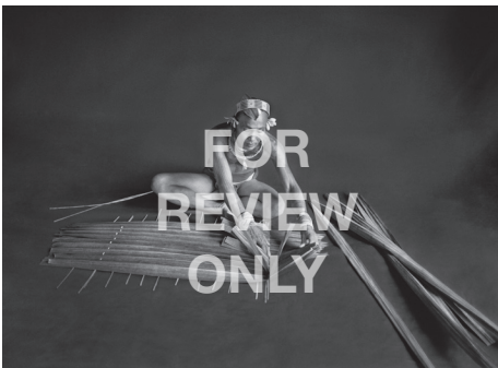
Sebastião Salgado, Teureum, sikeirei and leader of the Mentawai clan. This shaman is preparing a filter for sago, with the leaves of this same sago tree. Siberut Island. West Sumatra. Indonesia. 2008. © Sebastião Salgado/Amazonas Images-Contact Press Images.