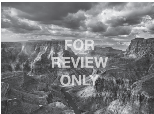
Sebastião Salgado, View of the junction of the Colorado and the Little Colorado from the Navajo territory. The Grand Canyon National Park begins after this junction. Arizona. USA. 2010.