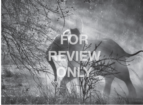
Sebastião Salgado, Since elephants are hunted by poachers in Zambia, they are scared of humans and vehicles. Alarmed when they see an approaching car, they usually run quickly into the bush. Kafue National Park. Zambia. 2010. © Sebastião Salgado/Amazonas Images-Contact Press Images.