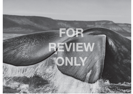
Sebastião Salgado, Southern Right whales, drawn to the Valdés Peninsula because of the shelter provided by its two gulfs, the Golfo San José and the Golfo Nuevo, often navigate with their tails upright in the water. Valdés Peninsula, Argentina. 2004. © Sebastião Salgado/Amazonas Images-Contact Press Images.