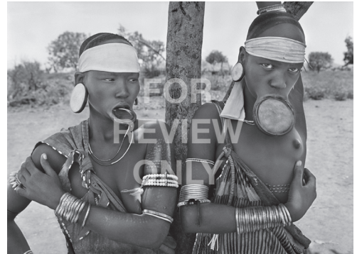
Sebastião Salgado, The Mursi and the Surma women are the last women in the world to wear lip plates. No anthropologist has been able to explain with certainty the origin and the function of this practice. Mursi village of Dargui in Mago National Park, in the Jinka Region. Ethiopia. 2007. © Sebastião Salgado/Amazonas Images-Contact Press Images.