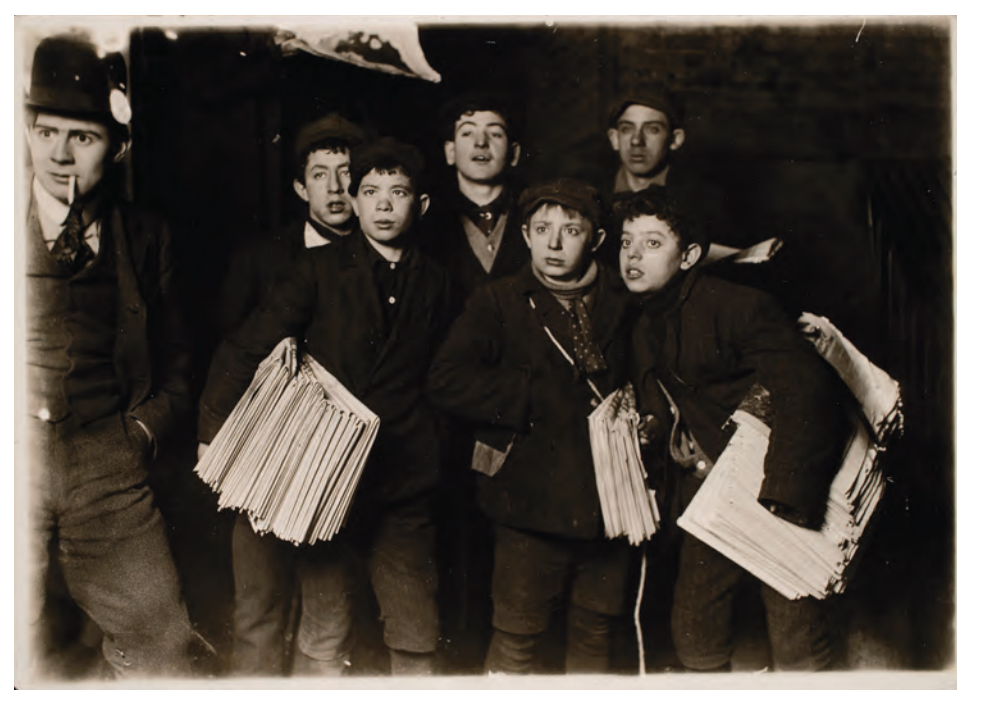
Lewis W. Hine, Midnight at the Brooklyn Bridge, 1906.

This is a photograph of newsboys, young children who worked hard at selling newspapers and earned very little. Lewis Hine photographed many young children working under illegal, difficult, and even dangerous conditions.