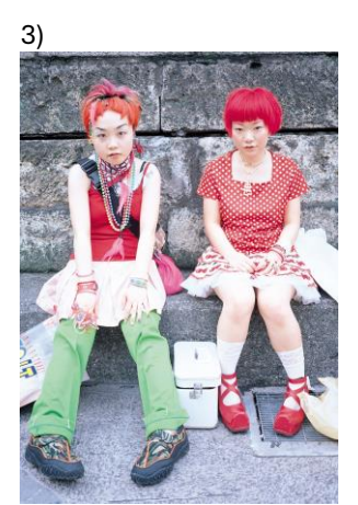
Shoichi Aoki, FRUITS_013-1998/06-#1009_#1010, 1998. Courtesy Shoichi Aoki