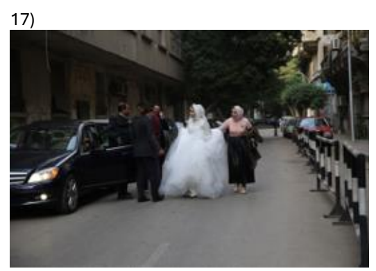
Randa Saath, from the series Cairo Streets, 2019.