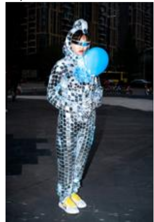
Feng Li, Mirror Girl, 2018. © Feng Li