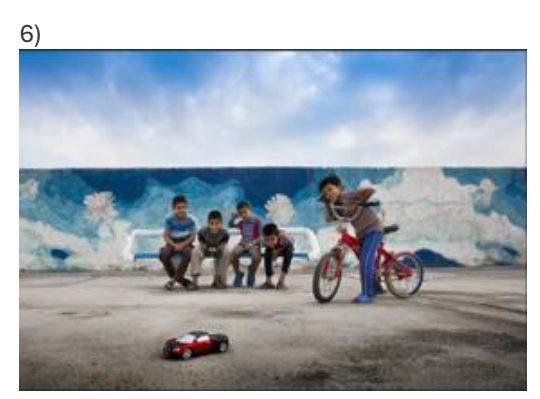
Farnaz Damnabi, Untitled, Birjand, Iran, 2017. Courtesy of Farnaz Damnabi and 29 Arts In Progress gallery