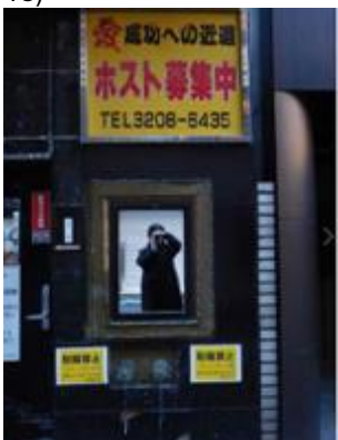
Daido Moriyama, From the series Pretty Woman , 2017.