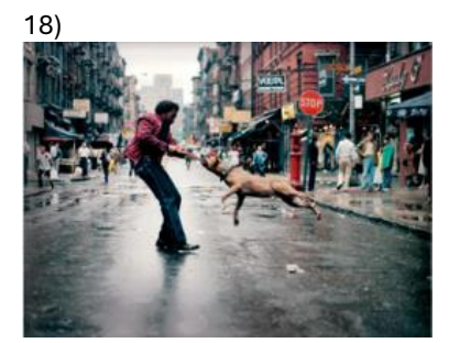
Jamel Shabazz, Man & Dog on the Lower East Side, 1980.