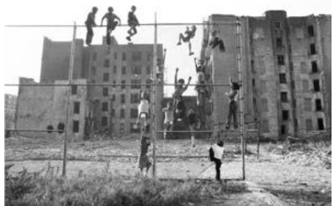
Martha Cooper, Kids climbing a fence in an abandoned lot, Lower East Side, NYC from the series Street Play, 1978. © Martha Cooper