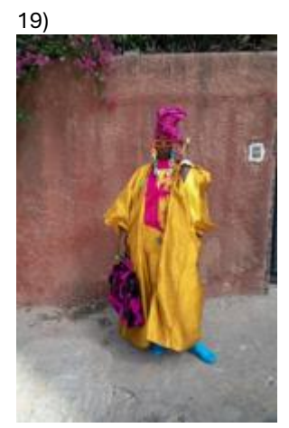
Trevor Stuurman, Untitled (A Day in Dakar), 2023. © Trevor Stuurman