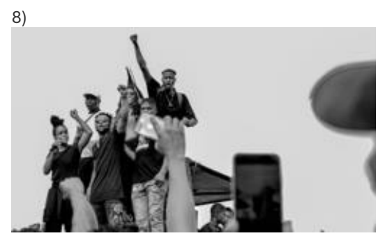
Grace Ekpu, Protesters at the Lekki-Ikoyi tollgate calling for an end to the rogue police unit, Special Anti-robbery Squad, Lagos, Nigeria, October 2020. © Grace Ekpu