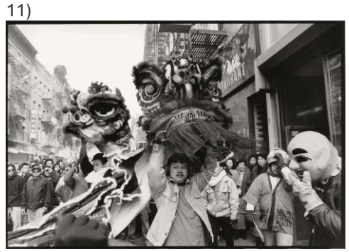
Chinatown Community Young Lions performing at the Lunar New Year parade in Chinatown, New York, 1996.