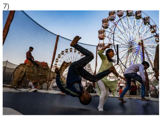
Debrani Das, Cartwheels of Pushkar, from the series Anonymous, 2022.