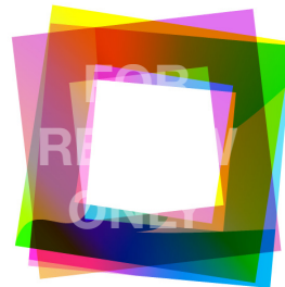
Artie Vierkant, Image Object Friday 7 June 2013 4:33PM , 2013. © Artie Vierkant, courtesy Higher Pictures, New York.