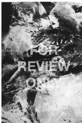
Floris Neusüss, Nachtbild (48) , 1991. © Floris Neusüss, courtesy the artist and Von Lintel Gallery, New York.