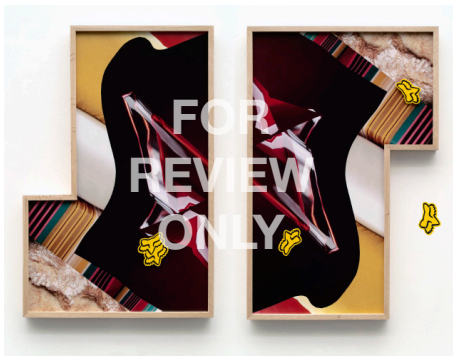
Kate Steciw, Armchair, Background, Basic, Beauty, Bed, Bedside, Bread, Breakfast, Bright, Cereal, Closeup, Cloth, Color, Contemporary, Couch, Crust, Day, Decor, Fox, Frame, Grain, Ingredient, Interior, Invitation, Irregular, Juice, Life, Living, Loaf, Luxury, Macro, Sofa, Speed, Style, Sweet, Texture . 2013. 1 and 2 of infinite. © Kate Steciw.