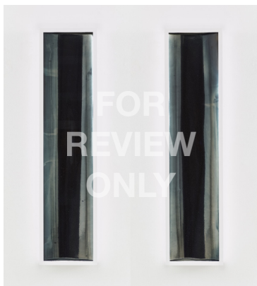
Liz Deschenes, Untitled (zoetrope) #1 and Untitled (zoetrope) #2 , 2013. © Liz Deschenes, courtesy Miguel Abreu Gallery, New York.