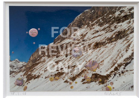
Gerhard Richter, 18.2.08, 2008.