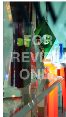
Owen Kydd, Pico Boulevard (Nocturne) , 2012. Courtesy the artist and Nicelle Beauchene Gallery. © Owen Kydd.