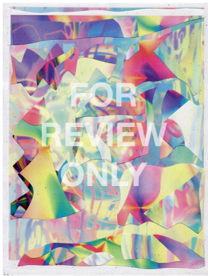
Travess Smalley, Capture Physical Presence #15 , 2011.