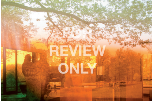
James Welling, 6236 , 2008.