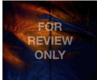
Eileen Quinlan, The Drink , 2011.