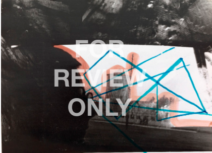
Sigmar Polke, Untitled (Mariette Althaus) , Early 1970s.