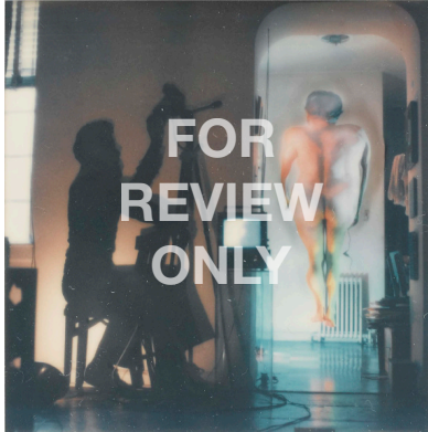
Lucas Samaras, Photo-Transformation , July 4, 1975. © Lucas Samaras, courtesy Pace Gallery; Photo: Kerry Ryan McFate.