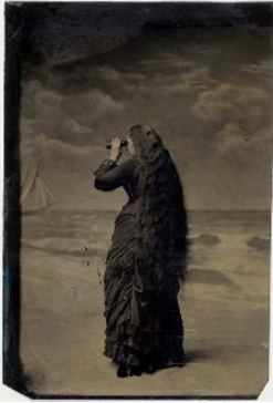
Unidentified Photographer, [Unidentified Woman at "Beach"], ca. 1880. International Center of Photography, Museum Purchase, 2009 (2009.3.1)