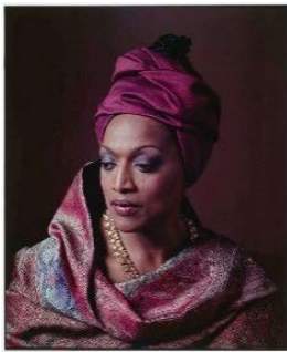
David Seidner, Jessye Norman, ca. 1995. International Center of Photography, David Seidner Archive (2007.65.5)