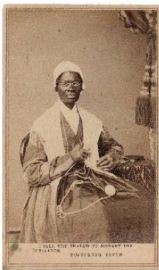
I Sell the Shadow to Support the Substance. Sojourner Truth, 1864.