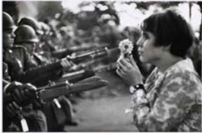
Marc Riboud, [Anti-Vietnam war demonstration, Washington], October 21, 1967. International Center of Photography (11.1975) © Marc Ribouc/Magnum Photos