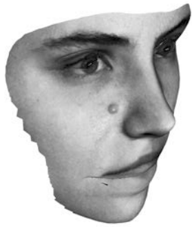
Adam Broomberg and Oliver Chanarin, The Revolutionary, from Spirit Is a Bone, 2013.