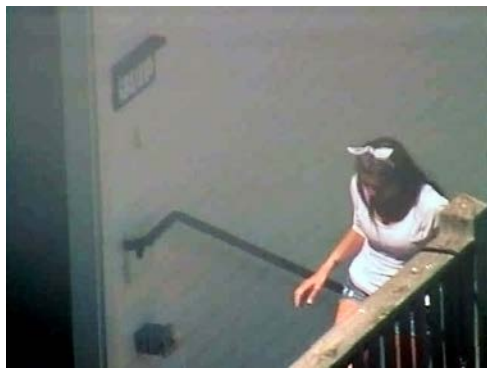
Andrew Hammerand, The New Town , 2013.