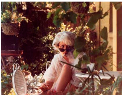
Cindy Sherman, Untitled, 1979, International Center of Photography, Gift of Photographers + Friends United Against AIDS, 1998.