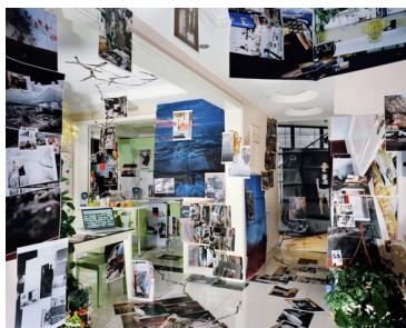
Guanyu Xu, Worlds Within Worlds , 2019. International Center of Photography, Purchase, with funds provided by the ICP Acquisitions Committee, 2022