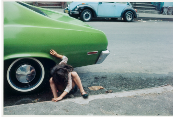
Helen Levitt, New York , 1980. International Center of Photography, Purchase, with funds provided by the ICP Acquisitions Committee, 2008.