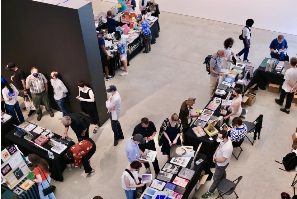
ICP Photobook Fest 2022

weekend also will feature more than 50 photographer book signings, as well as zine-making activity stations. The schedule for programming and book signings will be released on pbf.icp.org in the lead-up to Photobook Fest.