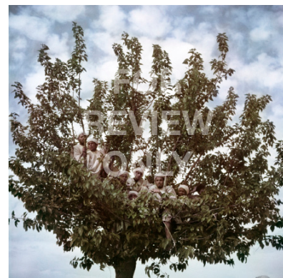
Robert Capa, [Spectators watching the visit of Sultan Sidi Mohammed from a tree, Fez, Morocco], 1949. © Robert Capa/International Center of Photography/Magnum Photos.