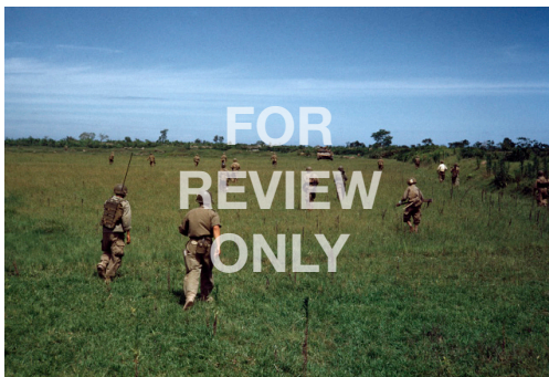
Robert Capa, [On the road from Namdinh to Thaibinh, Indochina, (Vietnam)], May 1954.