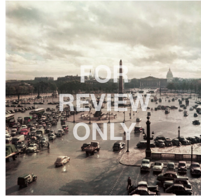
Robert Capa, [Place de la Concorde from the Time-Life office, Paris], ca. 1952. © Robert Capa/International Center of Photography/Magnum Photos.