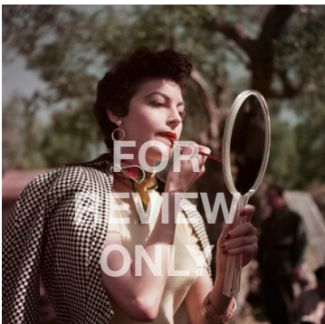
Robert Capa, [Ava Gardner on the set of The Barefoot Contessa , Tivoli, Italy], 1954. © Robert Capa/International Center of Photography/Magnum Photos.