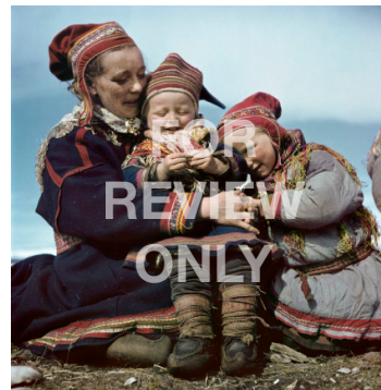
Robert Capa, [Lapp family, Norway], 1951. © Robert Capa/International Center of Photography/Magnum Photos.