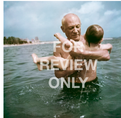
[Pablo Picasso playing in the water with his son Claude, Vallauris, France], 1948.