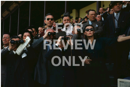
Robert Capa, [Spectators at the Longchamp Racecourse, Paris], ca. 1952. © Robert Capa/International Center of Photography/Magnum Photos.