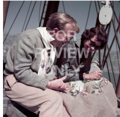
[Truman Capote and Jennifer Jones on the set of Beat the Devil, Ravello, Italy], April 1953.