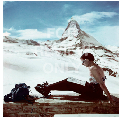
Robert Capa, [Skier sunbathing in front of the Matterhorn, Zermatt, Switzerland], 1950. © Robert Capa/International Center of Photography/Magnum Photos.