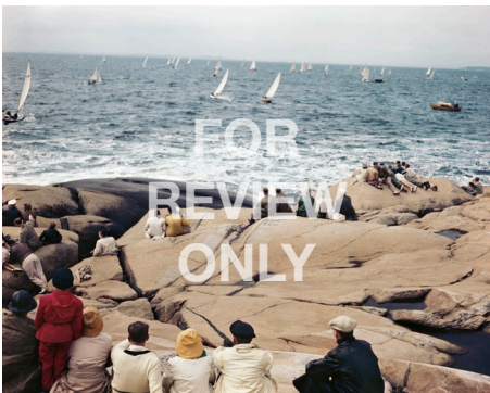
Robert Capa, [Sailing race, Lofoten Islands, Hankoe, Norway], 1951. © Robert Capa/International Center of Photography/Magnum Photos.