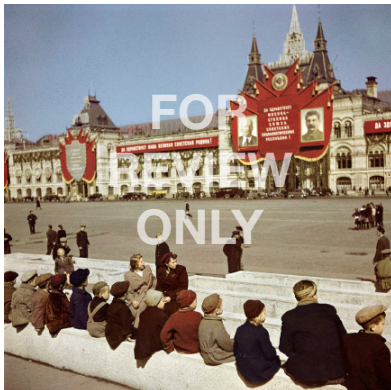
Robert Capa, [Young visitors waiting to see Lenin's Tomb at Red Square, Moscow], 1947. © Robert Capa/International Center of Photography/Magnum Photos.