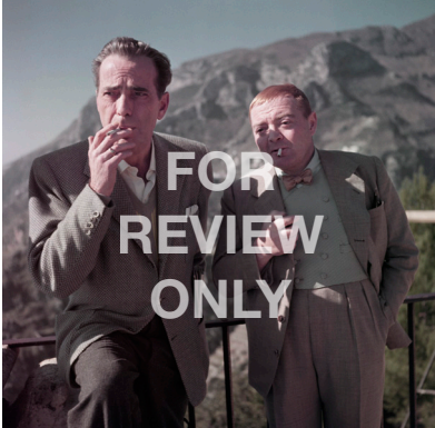
Robert Capa, [Humphrey Bogart and Peter Lorre on the set of Beat the Devil , Ravello, Italy], April 1953.