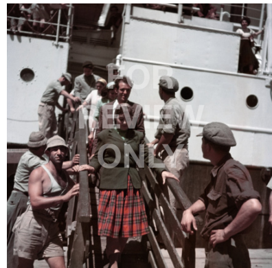
Robert Capa, [New immigrants disembarking from the Theodor Herzl, near Haifa, Israel], 1949-50. © Robert Capa/International Center of Photography/Magnum Photos.