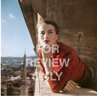
Robert Capa, [Capucine, French model and actress, on a balcony, Rome], August 1951.