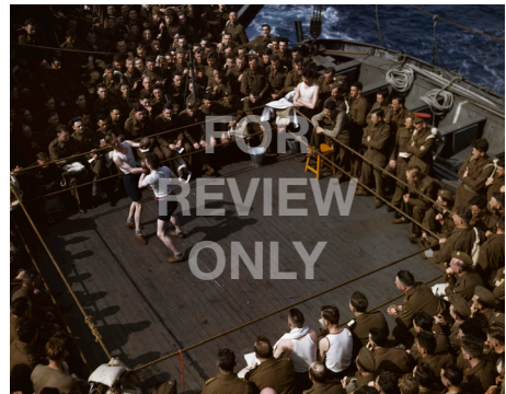
Robert Capa, [British soldiers watching a boxing match on a troop ship from England to North Africa], 1943.