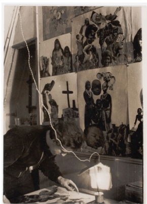
Robert Capa, [Artist making collages, Paris], 1934–35. International Center of Photography, The Robert Capa and Cornell Capa Archive, Gift of Cornell and Edith Capa, 1992. © International Center of Photography/Magnum Photos