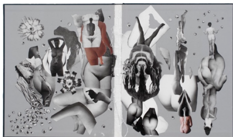
Justine Kurland, Eleanor , 2021.