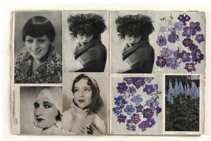
Hannah Höch, Album (Scrapbook) , 1933. Collage, Courtesy Berlinische Galerie, purchased with funds from Stiftung DKL, Berlin 1979 © 2021 Artists Rights Society (ARS), New York / VG Bild-Kunst, Bonn