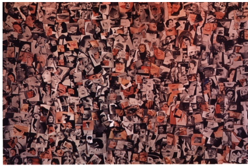
Harry Callahan, Collages , ca. 1957. International Center of Photography, Gift of Louis F. Fox, 1980. © The Estate of Harry Callahan, courtesy Pace Gallery