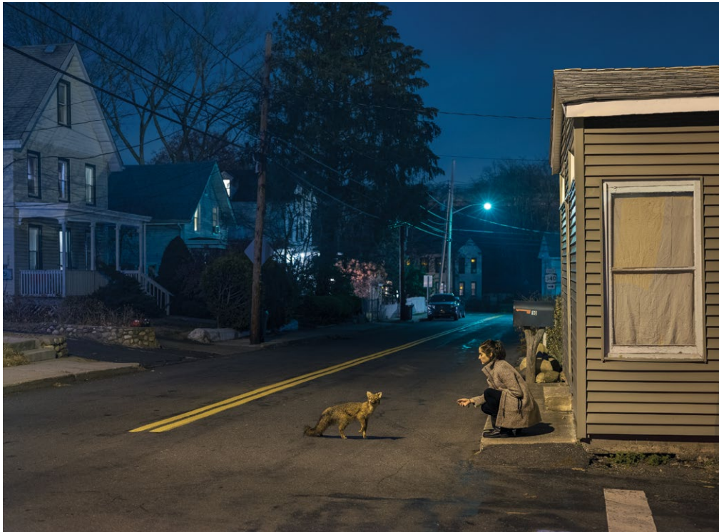
© Forrest Simmons (Advanced Track 2017)