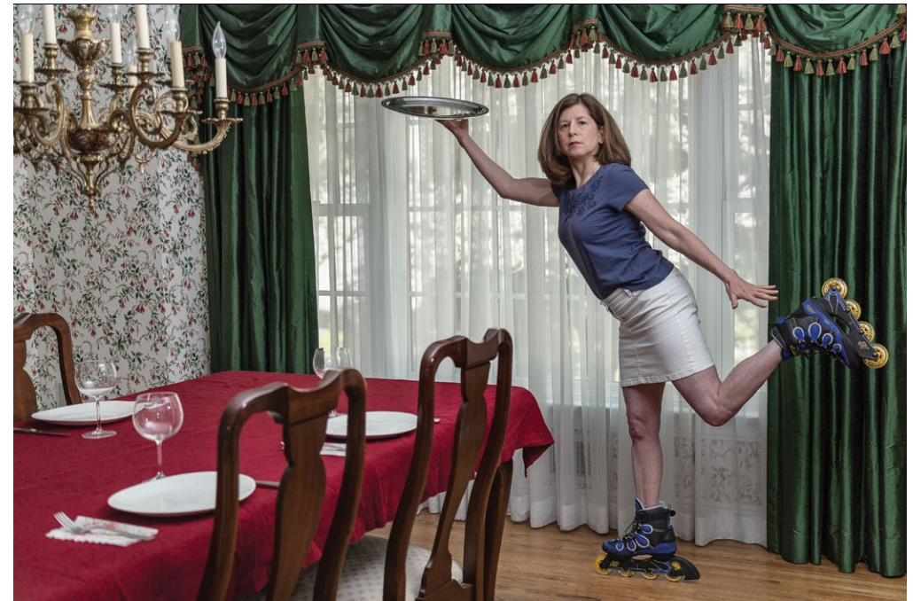
© Irene Wolpert (Advanced Track 2018)

To further hone their skills, Advanced Track students may enroll in two electives selected from the broader Continuing Education course offerings throughout their year of study. These students participate in a group exhibition at ICP in the year that follows their completion of the program.