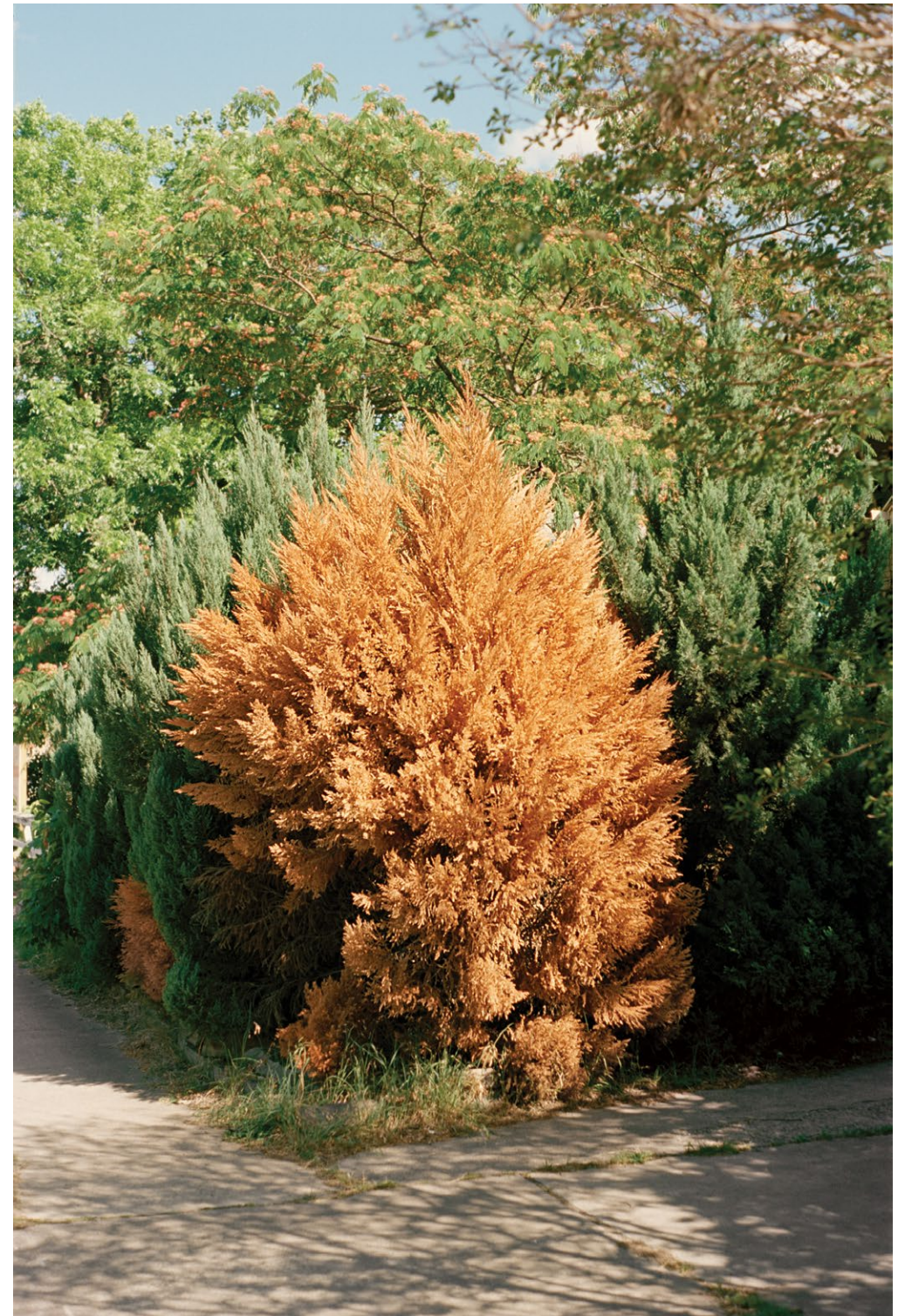
(Advanced Track 2017)