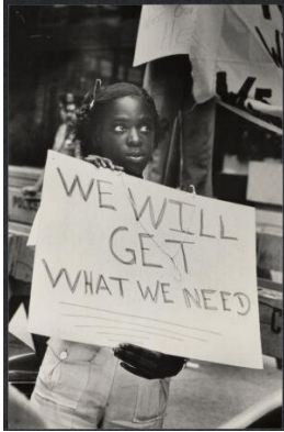
Bettye Lane, NY City Hall 'For Jobs' demonstration, 1977 . Part of the Bettye Lane Photographs Collection, Schlesinger Library, Harvard Radcliffe Institute © Bettye Lane Photos