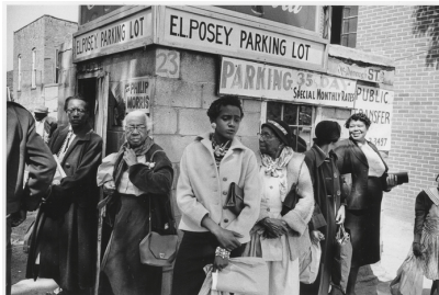
Bus boycott. Montgomery, Alabama, 1956, International Center of Photography, Museum Purchase, International Fund for Concerned Photography, 1974 (1012.1974)