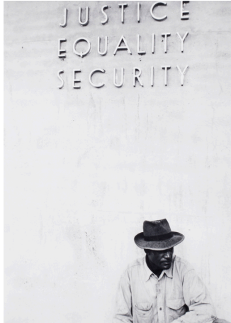
Mickey Pallas, Sugar Striker, Reserve, Louisiana, 1955. International Center of Photography, Gift of Mickey Pallas, 1987 (601.1987)