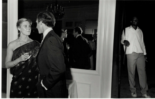
Belle Meade Country Club Belle Meade, Tenn-Lane, 1981

Barbara Norfleet, Belle Meade Country Club, Belle Meade, Tennessee, 1981 . Purchase, with funds provided by the ICP Acquisitions Committee, 2003 (176.2003) [Digital only]