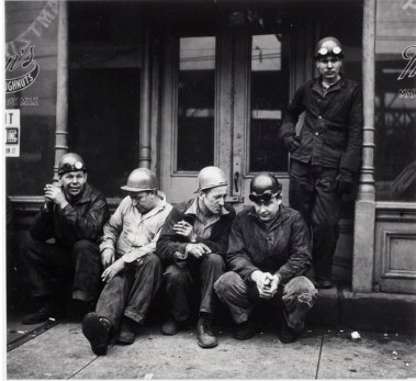
Todd Webb, Jones and Laughlin Steel Workers Relaxing, 1946. International Center of Photography, Museum Purchase, 1983 (192.1983)