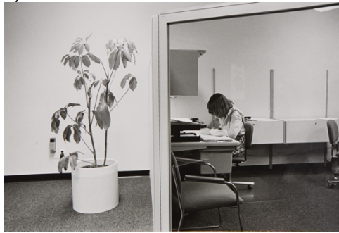
Per Brandin, Office Cubicle and Plant , Olympus Camera Corp, 1979.