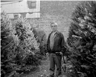
Dylan Vitone, Christmas Trees , 2001. © Dylan Vitone