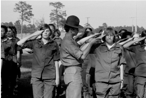
A Marine instructor shows young recruits how to salute, with their fingertips at eyebrow level, Fort Jackson, South Carolina, 1975.