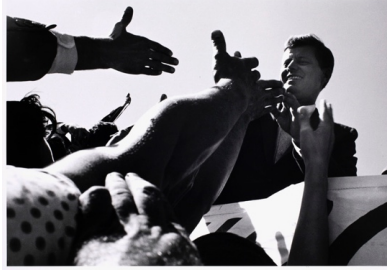
Cornell Capa, [John F. Kennedy shaking hands, Michigan], 1960. International Center of Photography, Gift of Cornell and Edith Capa, 2004 (107.2004)