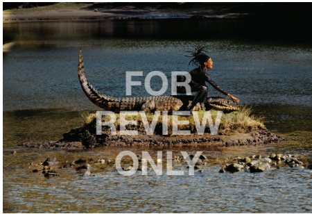
Jean-Paul Goude, Naomi Campbell ( Harper's Bazaar , September 2009)