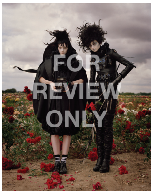
Tim Walker, Untitled ( Harper's Bazaar , October 2009)