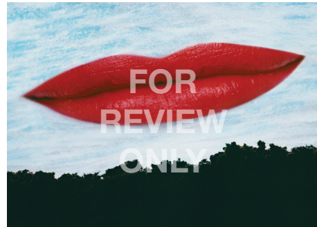
Patrick Demarchelier, Man Ray's floating lips ( Harper's Bazaar , February 2002)