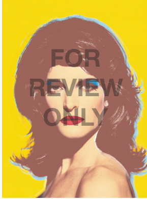
Patrick Demarchelier, Stephanie Seymour ( Harper's Bazaar , February 2002)