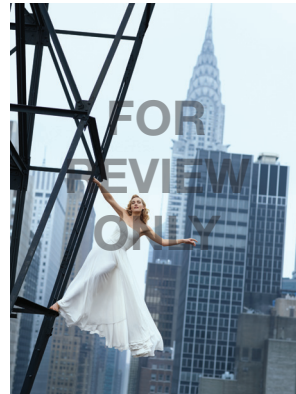
Kate Winslet ( Harper's Bazaar, August 2009)