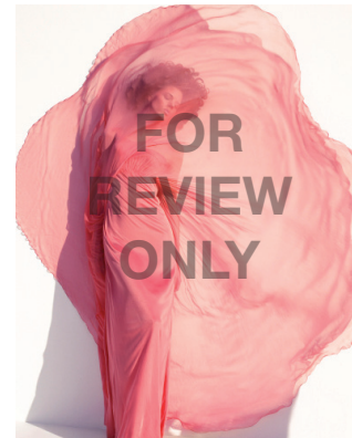
Solve Sundsbo, Freja Beha Erichsen ( Harper's Bazaar , March 2008)