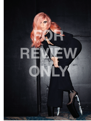
Terry Richardson, Lady Gaga ( Harper's Bazaar , May 2011)