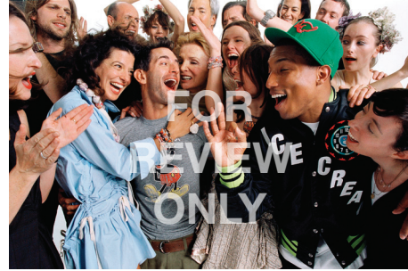
William Klein, Marc Jacobs ( Harper's Bazaar , March 2007)